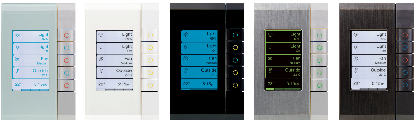
Ocean Mist (OM)

Or if you want it to stand out, choose a contrasting colour to create a striking design feature.