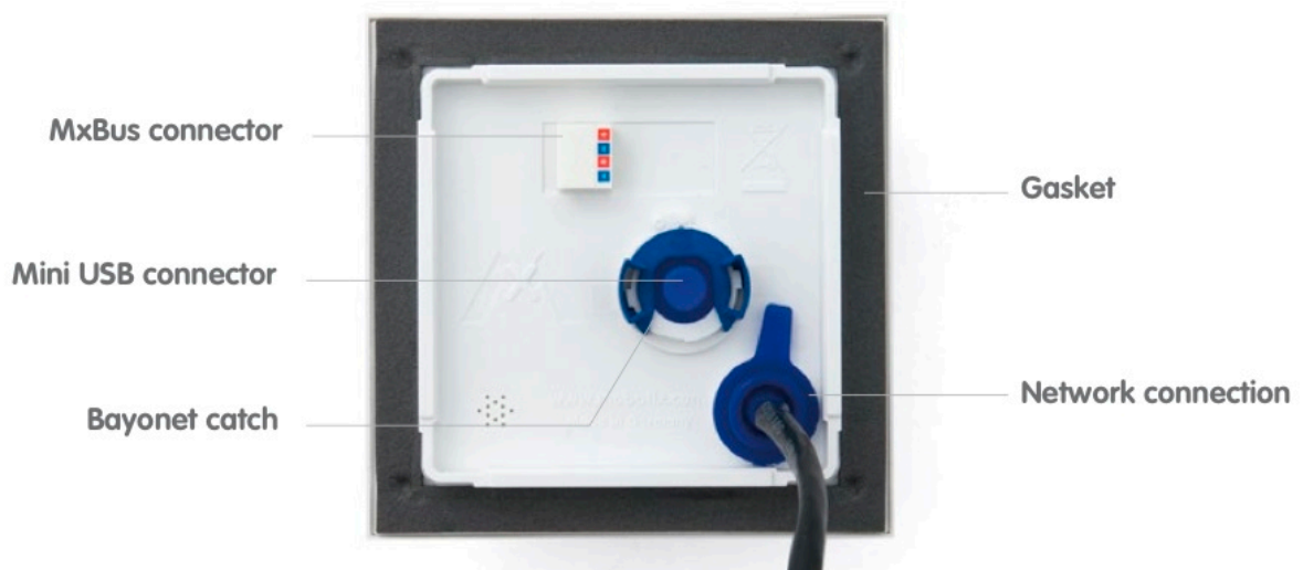
(T25 – Camera housing and connectors, excerpt from the technical documentation)