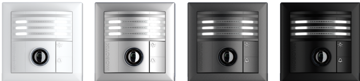
Comparable standard colors (not exactly the MX colors): White: RAL 9016, Silver: RAL 9006, Dark Gray: DB 703, Black: RAL 9005